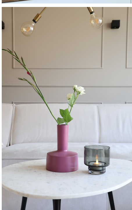
All shown home accessories are available in mauve, black, ivory and gold