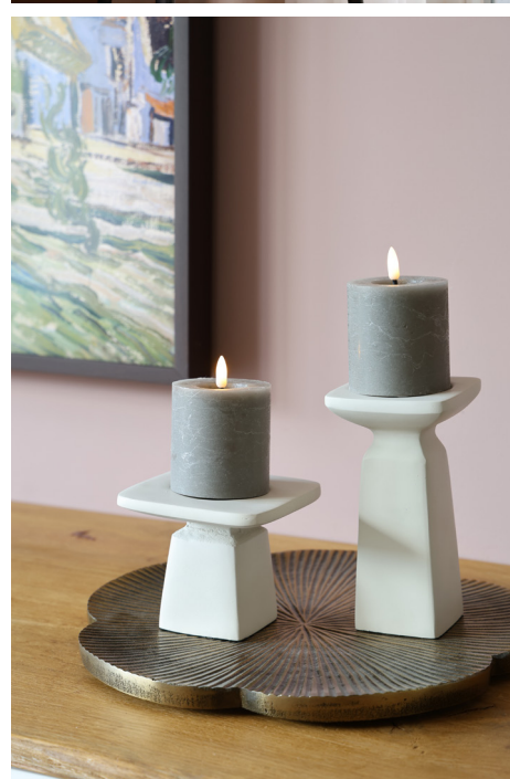
All shown home accessories are available in mauve, black, ivory and gold